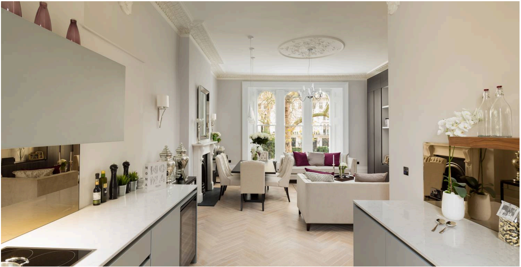
Kensington Gardens Square, London W2