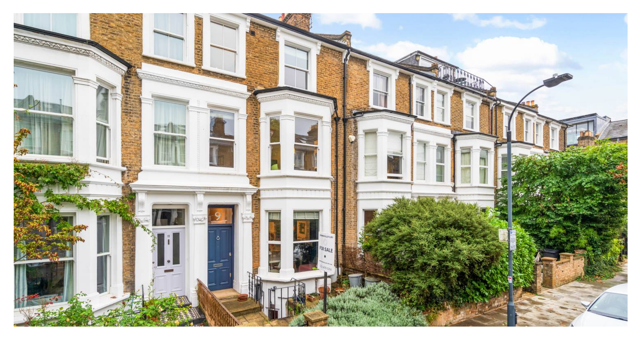
Weltje Road, London, W6